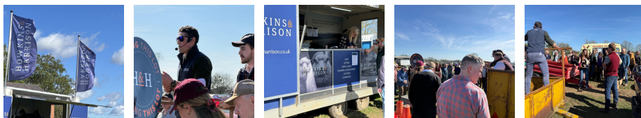
Photographs representative of Howkins & Harrison Farm Sales